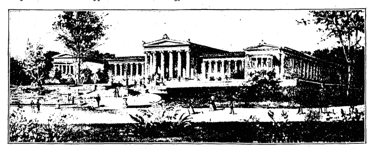
ALBRIGHT ART GALLERY.

artistic skill and handicraft in all the useful arts and in the broad fields of education, literature, libraries, physical science, the drama, architecture, civil engineering, hygiene, sanitation, medicine, surgery, nursing, charities and other elements of progress. The finest products of the mills, factories and laboratories will be exhibited here